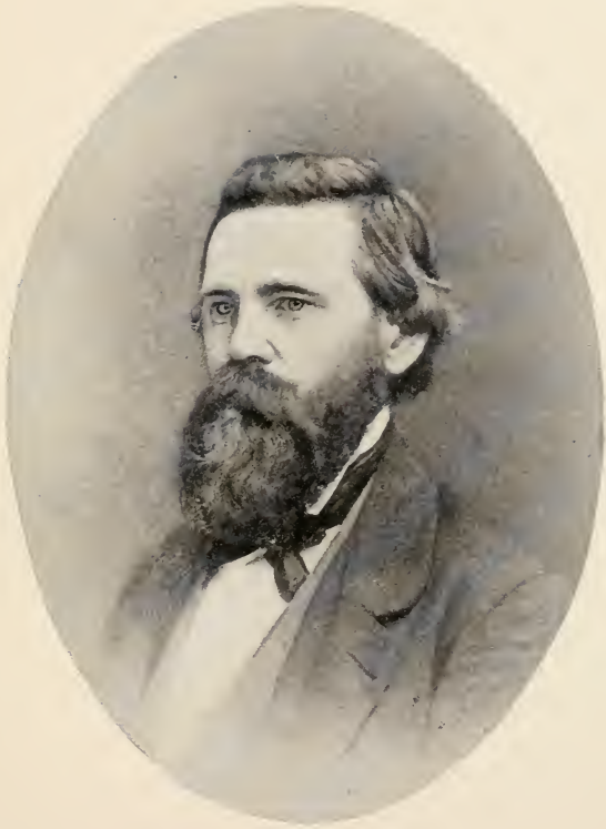
COLONEL RICHARD A. OAKFORD

Killed at battle of Antietam, September 17, 1862