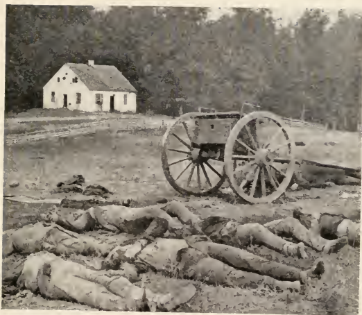
SILENCED CONFEDERATE BATTERY IN FRONT OF DUNKER CHURCH SHARPSBURG ROAD, ANTIETAM

This little brick church lay between the opposing lines, and both Union and Confederate wounded were gathered in it