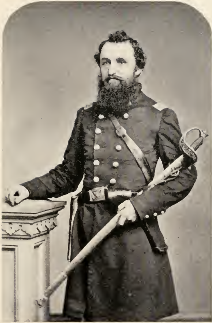
COLONEL CHARLES ALBRIGHT