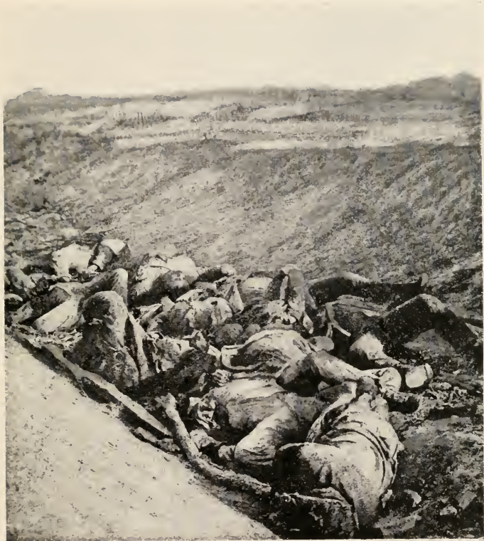
SECTION OF FAMOUS SUNKEN ROAD IN FRONT OF LINE OF 132D P. V., NEAR ROULETTE LANE

The dead are probably from the Sixth Georgia Confederate troops