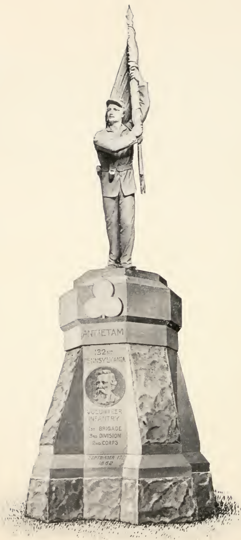
MONUMENT OF 132D REGIMENT, P. V. ERECTED BY THE STATE OF PENNSYLVANIA ON BATTLE-FIELD OF ANTIETAM, MD. DEDICATED SEPT. 17, 1904

It stands about two hundred yards directly in front of the battle line upon which this regiment fought, on the side of the famous "Sunken Road" occupied by the Confederates.